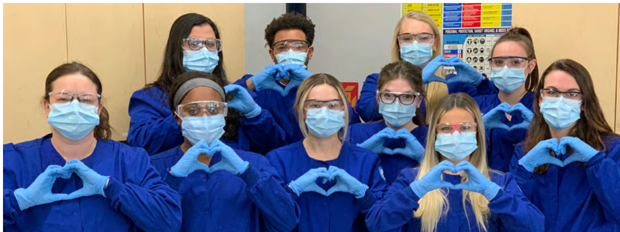
The dental assisting program at Southeastern Technical Institute in South Easton, Massachusetts, contributed this photo from their DARW celebrations held in March 2020.