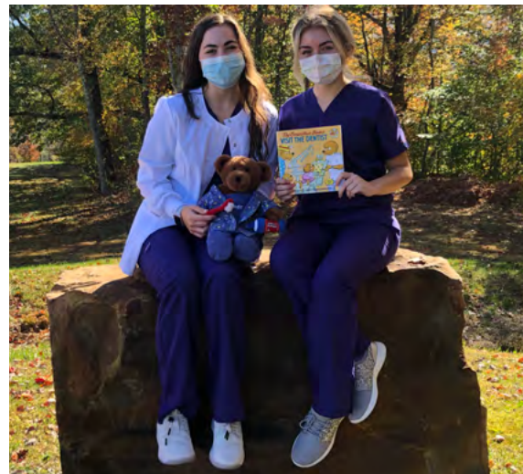
In October 2020, MECC students distributed Halloween treat bags and videos of themselves reading dental-related children’s books to local first-graders.

“I’d like to extend a huge shoutout to our MECC adjunct faculty members and to students for their resilience. We couldn’t have done this without them.”